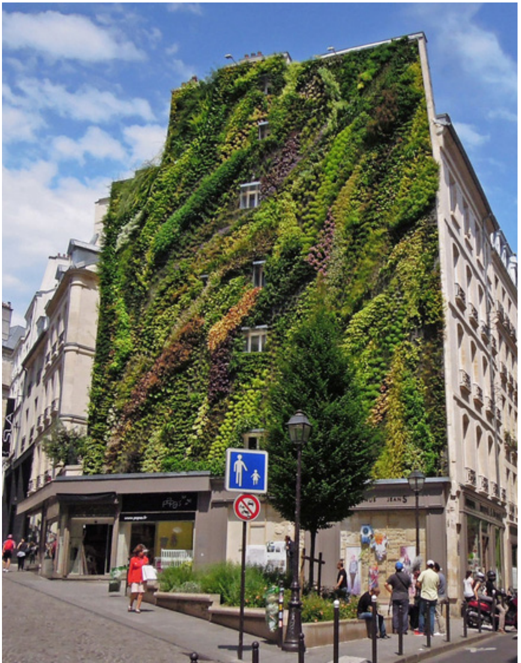
Vertical garden transforming a blind façade into an urban oasis, rue d'Aboukir. Artist Patrick White. It inspired the PB project "Gardens on walls" voted in 2014 © Patrick White ( http://www.verticalgardenpatrickblanc.com ).