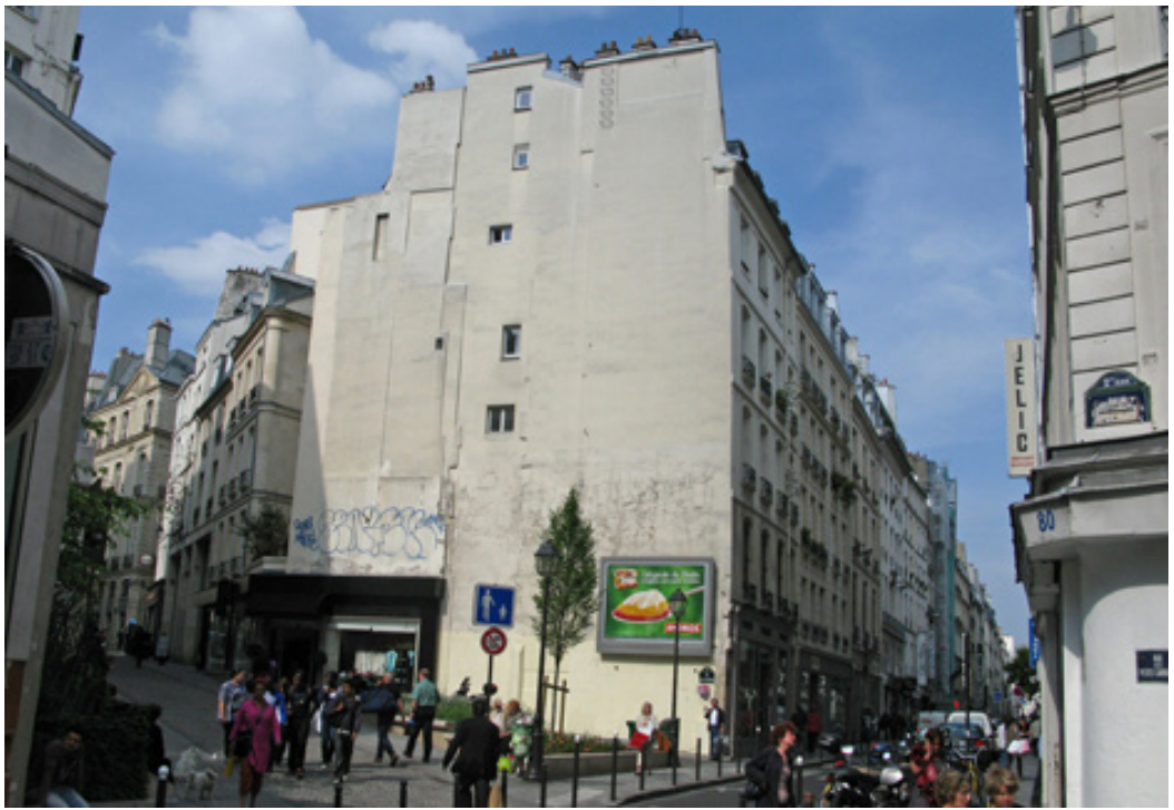
One among many Paris dull and blind façade, Rue d'Aboukir.

well engaging with a totally transparent process with citizens. But we should neither fear debate [...] nor transparency, as it is under citizen's scrutiny that democracy prospers”.