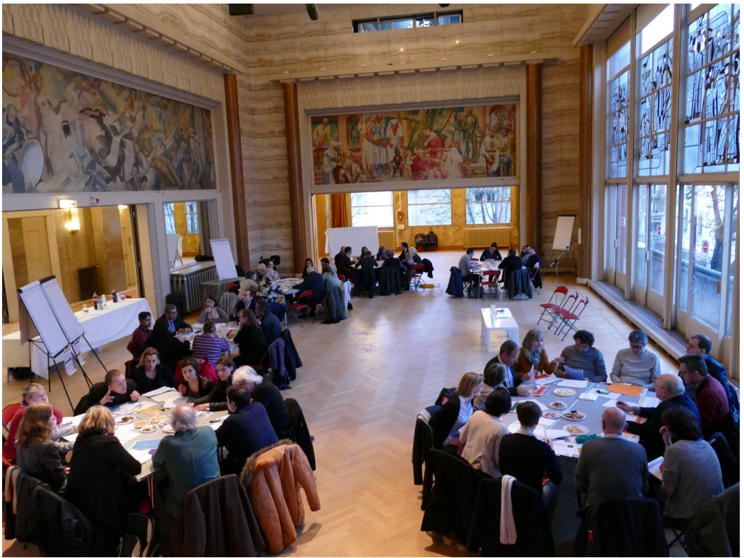
Workshop for co-construction of projects, gathering different individuals and associations who proposed similar projects or projects that could develop in synergy.