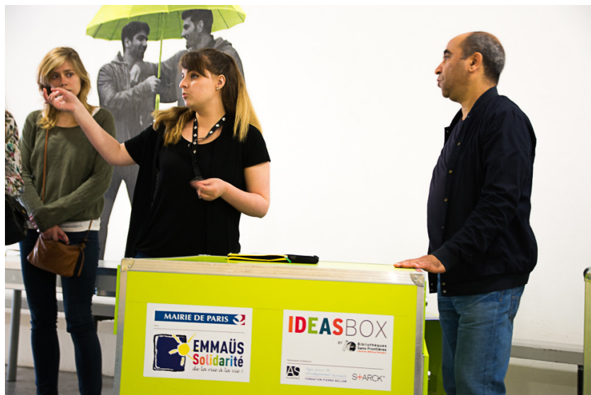
Voted PB Project: Ideas Box for solutions for Refugee Centre.

– Capacity Building and Training : workshops for citizens, permanent university for elderly and retired, etc.