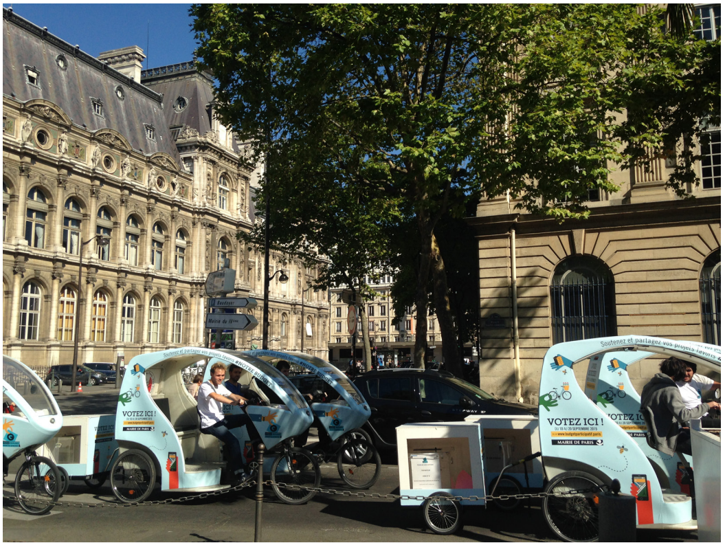
Bicycle driven mobile poll boxes, located in strategic public spaces in order to encourage voting.

Important budget per inhabitant put into debate. Paris has a population of approximately 2.3 million. After gradual increases during the first two PB cycles, in 2014 and 2015, the budget reached €100 million in 2016. Interestingly, Madrid, another PB newcomer, is allocating the same amount for its own PB. However, when comparing the amount allocated per habitant per year, Paris ranks first. PB investment per inhabitant per year in Paris is close to ten times more than what is being allocated in New York [approximately US $35 million for 8.6 million inhabitants], or in Seoul [approximately US $46 million for a population over 10 million]. Less than US $5 are allocated through PB in these two cities per inhabitant, compared to around 50 US$ per inhabitant in Paris. Madrid allocated €100 million for its 3.2 million inhabitants in 2016, which amounts to $36 per inhabitant. Paris and Madrid rank towards the top when compared with most PB experiences, however a broader global analysis [Cabannes,