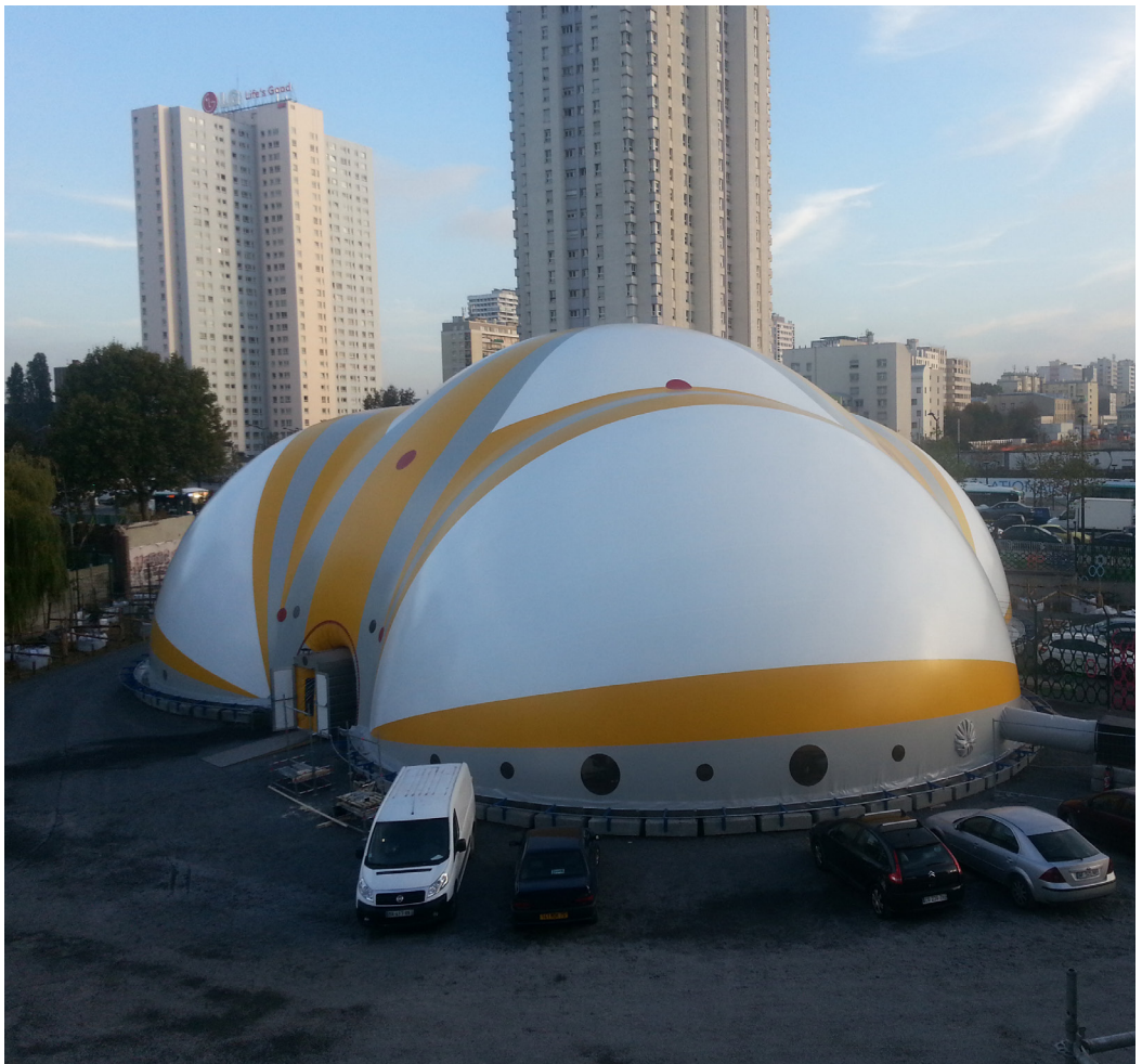
One of the project under the Homes for the homeless voted PB project is to increase the level of investment for this recently built refugee centre.

– Open space [public bath and shower / bains douches ]: “I would like to see in République neighbourhood a social centre for Homeless and other people in need that would allow them to take a shower, wash their clothes and protect their effects.