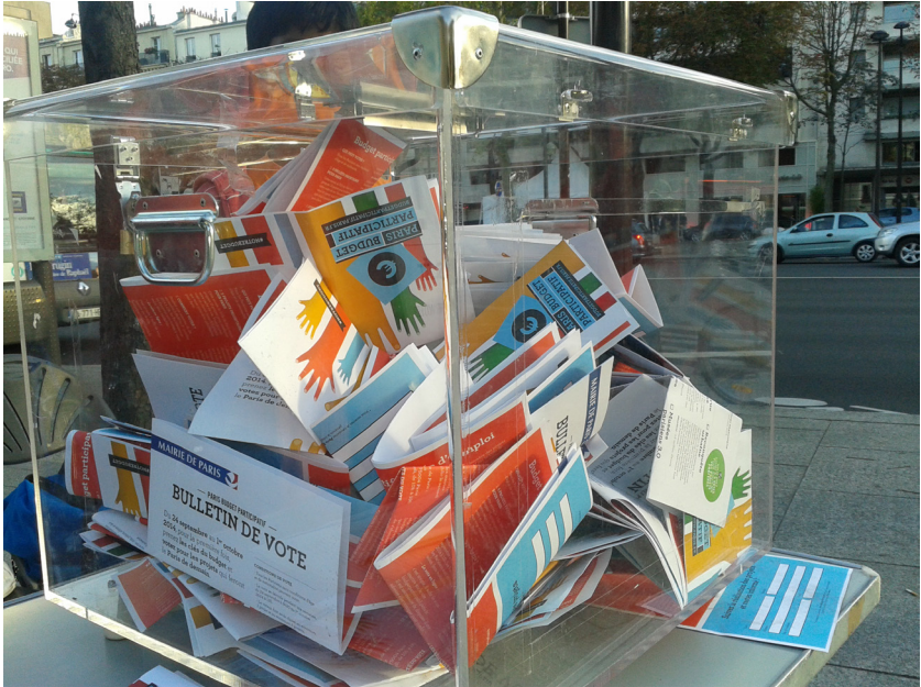
Street located PB poll box

This mixed council is particularly interesting as it gathers high ranking city members and gives space to various collectives that have been directly