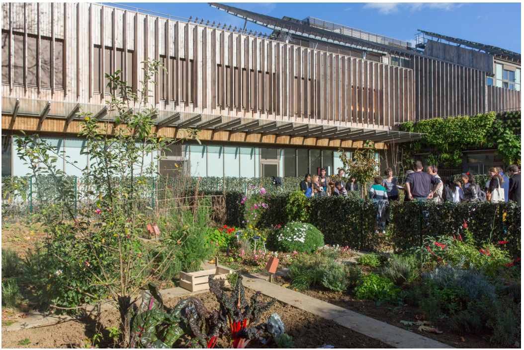
Urban farming in schools. Project approved in 2014 and currently running