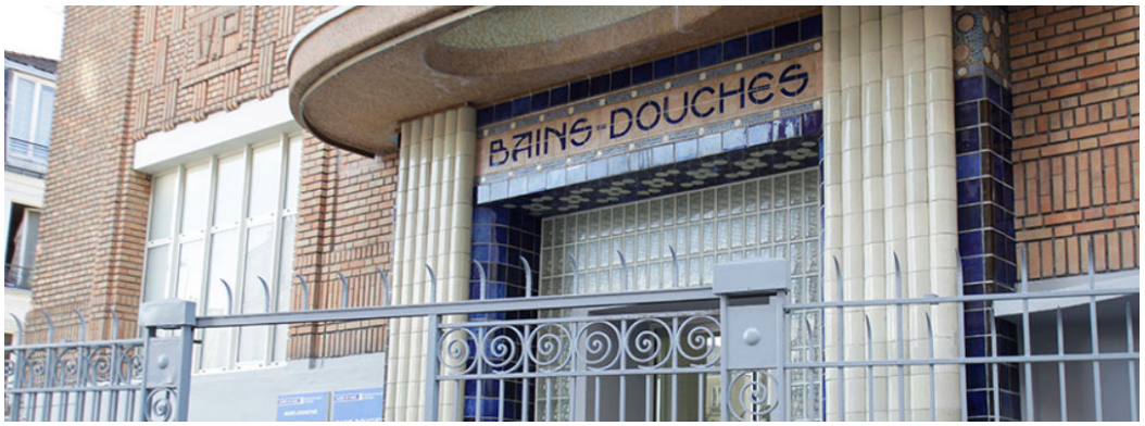
PB voted project. Traditional and historic “ Bains Douches ” where Parisians can take showers and bath when their apartment is not provided with the service, are now refurbished and improved for servicing homeless people. Here art deco Bains-Douches building located in Oberkambf neighbourhood

An invisible dimension of Paris PB that is worth highlighting is the originality of ideas that were proposed in the first instance, and that were subsequently scrutinized and selected or rejected by the local authority commission, and then developed and clustered into four projects and one program. They are the heart of the innovation, either coming from individuals or from grassroots and civil society organisations. They seem to be the true gold mine to build other possible cities. Selected original projects that generated the final sub programmes illustrate this idea. They are translated directly from the French in order to retain their original concept: