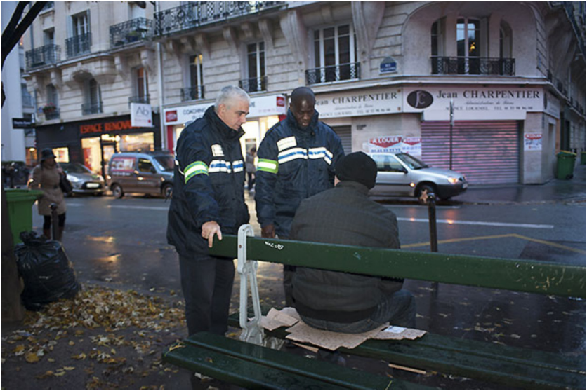
Homelessness is a critical issue in Paris and Parisians expressed their solidarity with homeless, refugees and migrants: the program Home for the homeless was the most voted PB project in 2016.

significant resources. Among the eight projects for Paris as a whole, the following can be highlighted as particularly innovative: