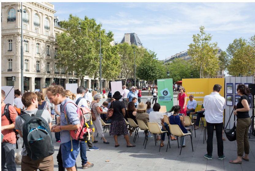
Public presentation and vote for 2016 PB projects.

2015] indicates that some small or intermediate cities are debating significantly more resources per inhabitant. For example, in a recent case from São Bernardo do Campo in the Metropolitan Region of São Paulo and the fourth Brazilian city in investment capacities: PB allocated per inhabitant is over three times what is debated in Paris or Madrid (US $145 in 2015 and 2016 despite a plummeting exchange rate between Brazilian Real and US Dollar). The amount debated and spent in absolute numbers amounted to US $221 million for the bi-annual cycle 2015-2016. One original and positive aspect of the Paris PB experience was the announcement of an overall PB value of €500 million for the whole 2014-2020 period. This is relatively uncommon, and quite innovative, as it raises a sense of the medium term gains and helps build confidence between the city and its citizens. Citizens are realizing that these resources are quite significant and that PB is a key tool, even if still limited [5 % of total investment] when compared with Paris' overall budget of close to €10 billion. At the same time, opening up a secured medium term perspective allows citizens and grassroots organisations to develop their own strategies and proposals through time.