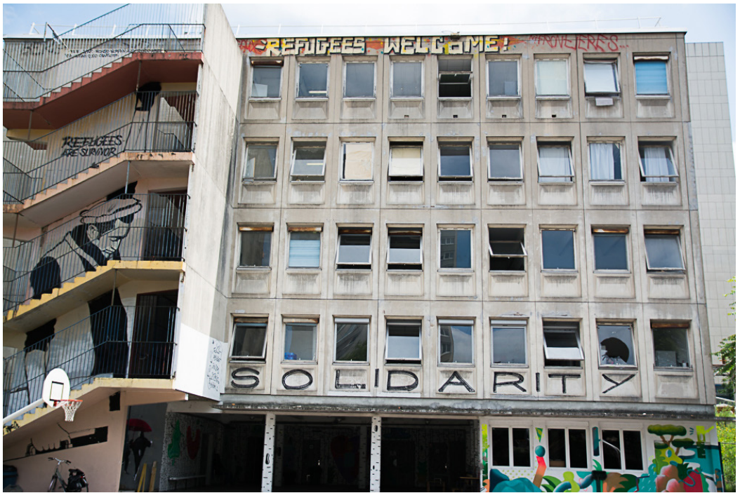
Exemplary PB project under the voted Homes for the Homeless vote program: A derelict building is transformed into a centre for refugees and migrants.

In 2015, out of 5000 projects submitted either by individuals [2/3 of total] or collectives [1/3], 1500 qualified as feasible. Eight projects were selected for Paris as a whole and 180 for projects at the district scale. The budget at stake expanded significantly from 2014: the 8 projects for Paris amounted to €35.2 million whereas the 180 district scale ones accounted for €37.7 million.