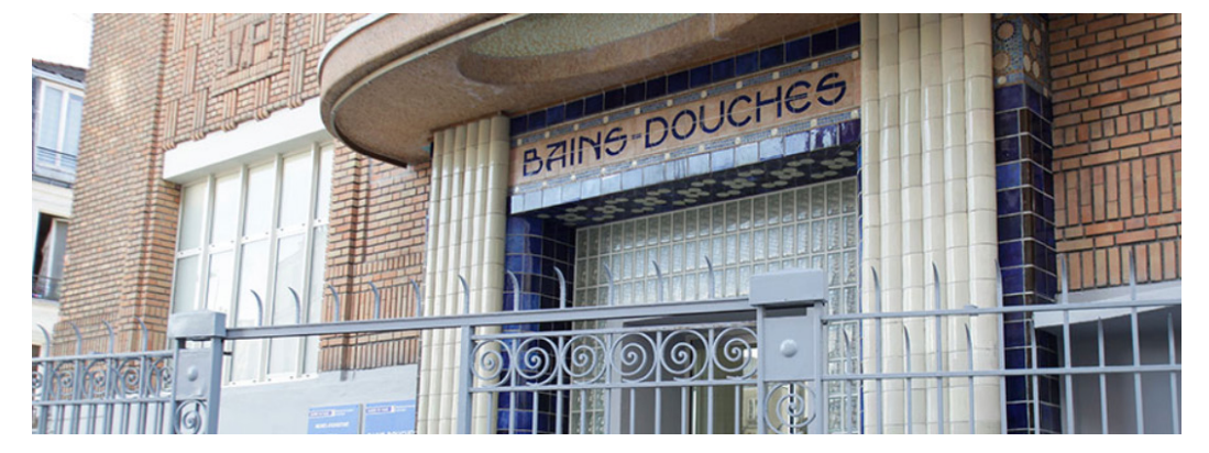
PB voted project. Traditional and historic "Bains Douches" where Parisians can take showers and bath when their apartment is not provided with the service, are now refurbished and improved for servicing homeless people. Here art deco Bains-Douches building located in Oberkambf neighbourhood

An invisible dimension of Paris PB that is worth highlighting is the originality of ideas that were proposed in the first instance, and that were subsequently scrutinized and selected or rejected by the local authority commission, and then developed and clustered into four projects and one program. They are the heart of the innovation, either coming from individuals or from grassroots and civil society organisations. They seem to be the true gold mine to build other possible cities. Selected original projects that generated the final sub programmes illustrate this idea. They are translated directly from the French in order to retain their original concept: