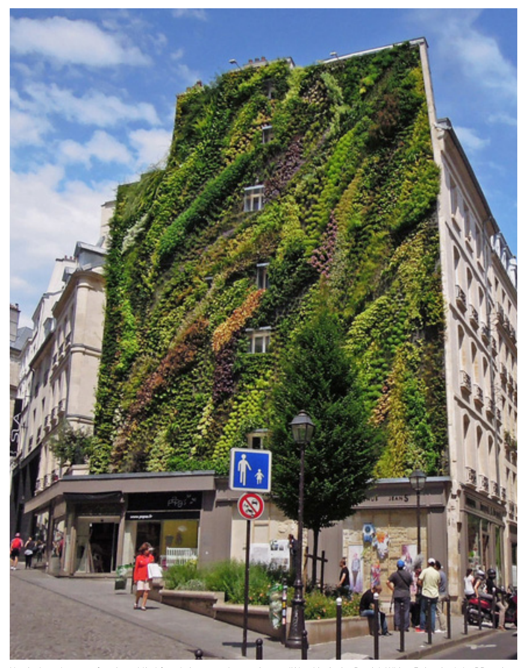
Vertical garden transforming a blind façade into an urban oasis, rue d'Aboukir. Artist Patrick White. It inspired the PB project "Gardens on walls" voted in 2014 © Patrick White (http://www.verticalgardenpatrickblanc).