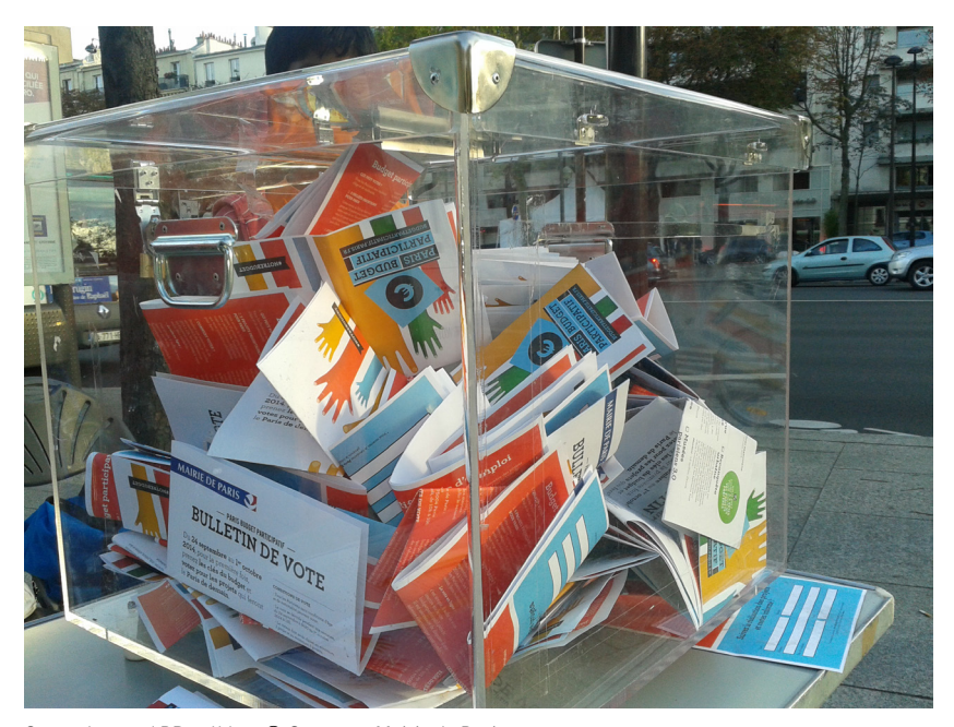
Street located PB poll box

This mixed council is particularly interesting as it gathers high ranking city members and gives space to various collectives that have been directly