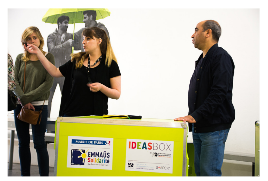
Voted PB Project: Ideas Box for solutions for Refugee Centre.

- Capacity Building and Training: workshops for citizens, permanent university for elderly and retired, etc.