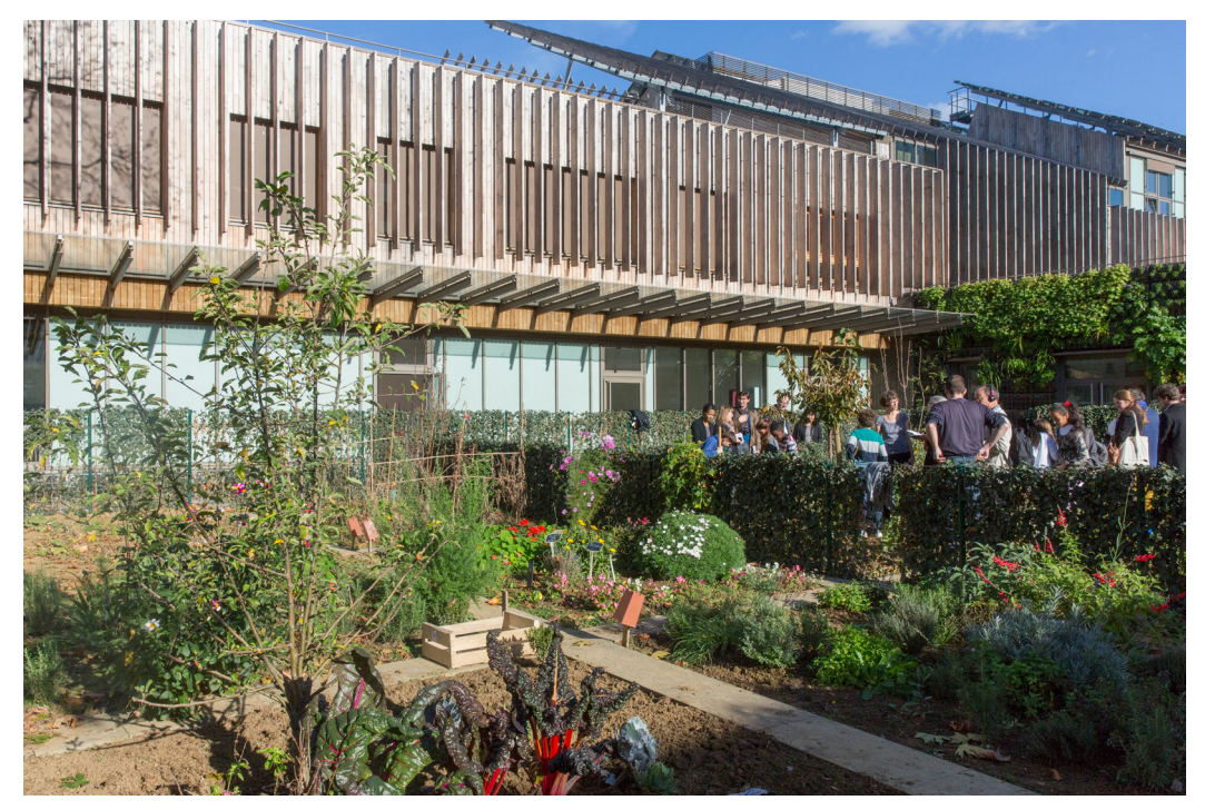
Urban farming in schools. Project approved in 2014 and currently running