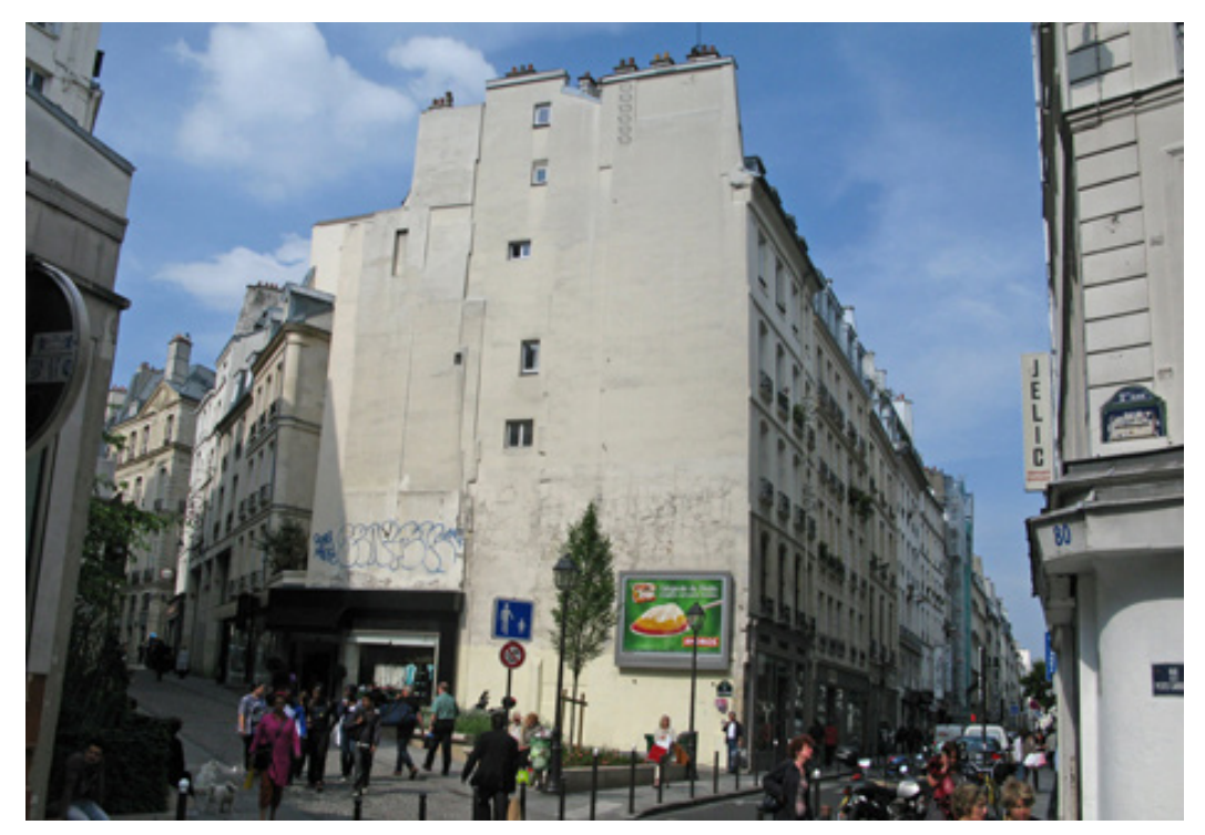
One among many Paris dull and blind façade, Rue d'Aboukir.

well engaging with a totally transparent process with citizens. But we should neither fear debate [...] nor transparency, as it is under citizen's scrutiny that democracy prospers".