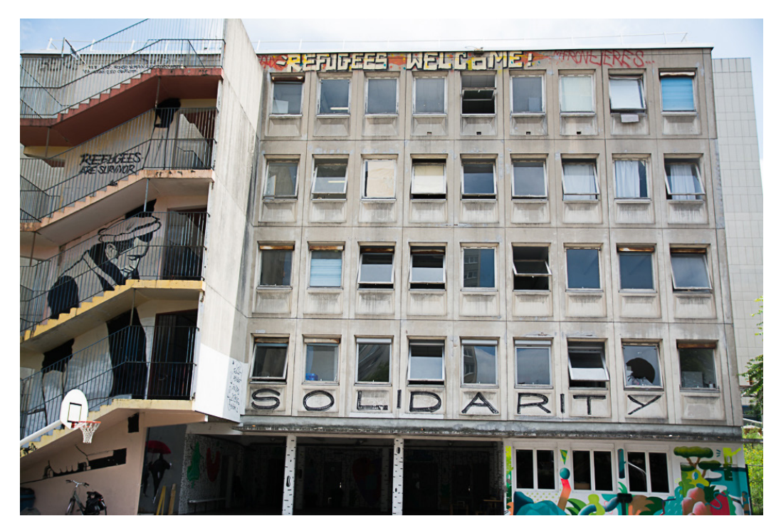
Exemplary PB project under the voted Homes for the Homeless vote program : A derelict building is transformed into a centre for refugees and migrants.

In 2015, out of 5000 projects submitted either by individuals [2/3 of total] or collectives [1/3], 1500 qualified as feasible. Eight projects were selected for Paris as a whole and 180 for projects at the district scale. The budget at stake expanded significantly from 2014: the 8 projects for Paris amounted to \epsilon 35.2 million whereas the 180 district scale ones accounted for \epsilon 37.7 million.