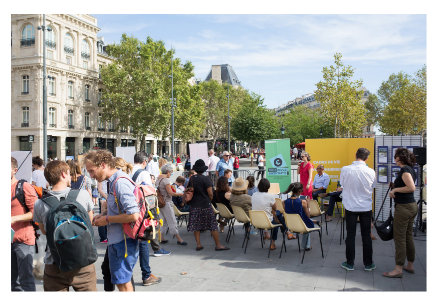
Public presentation and vote for 2016 PB projects.

2015] indicates that some small or intermediate cities are debating significantly more resources per inhabitant. For example, in a recent case from São Bernardo do Campo in the Metropolitan Region of São Paulo and the fourth Brazilian city in investment capacities: PB allocated per inhabitant is over three times what is debated in Paris or Madrid (US $145 in 2015 and 2016 despite a plummeting exchange rate between Brazilian Real and US Dollar). The amount debated and spent in absolute numbers amounted to US $221 million for the bi-annual cycle 2015-2016. One original and positive aspect of the Paris PB experience was the announcement of an overall PB value of €500 million for the whole 2014-2020 period. This is relatively uncommon, and quite innovative, as it raises a sense of the medium term gains and helps build confidence between the city and its citizens. Citizens are realizing that these resources are quite significant and that PB is a key tool, even if still limited [5 % of total investment] when compared with Paris' overall budget of close to €10 billion. At the same time, opening up a secured medium term perspective allows citizens and grassroots organisations to develop their own strategies and proposals through time.