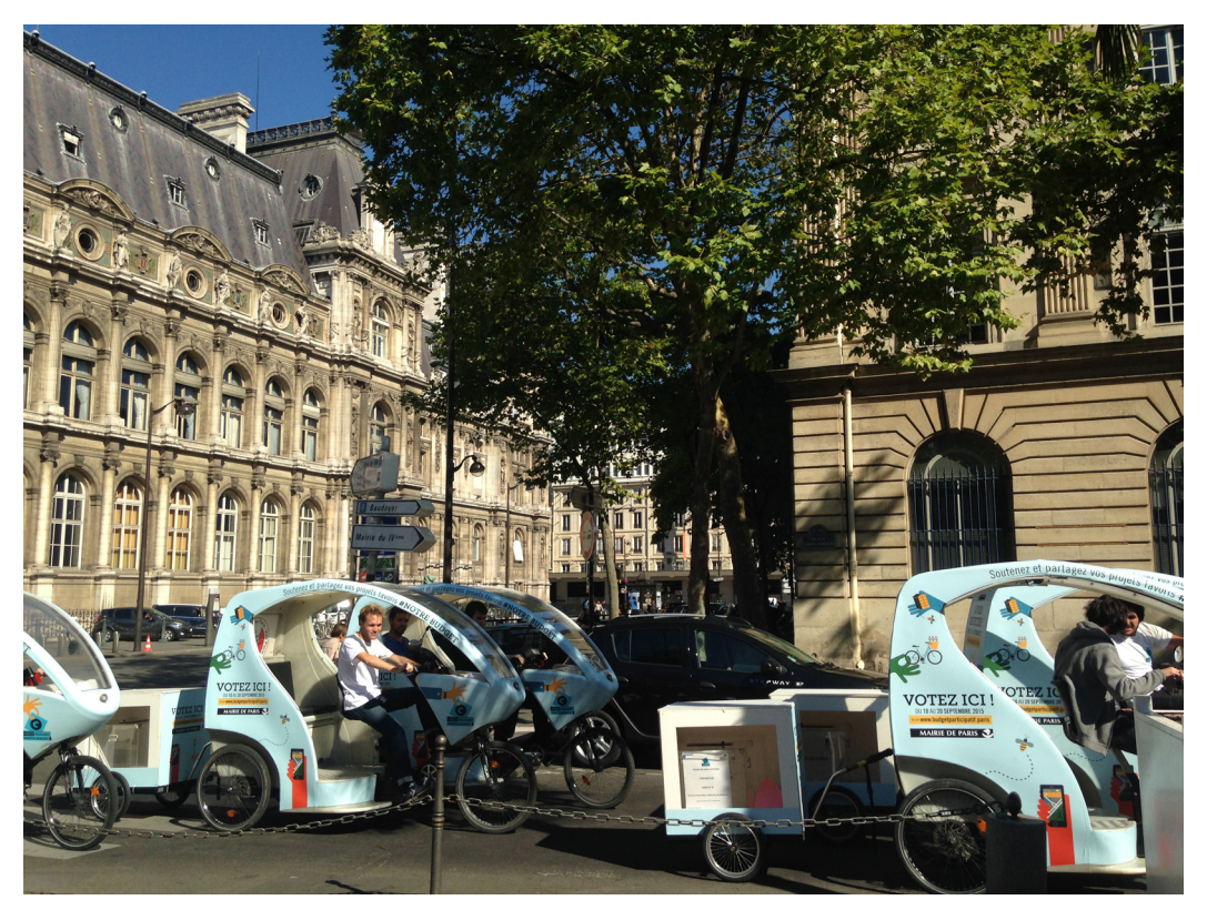
Bicycle driven mobile poll boxes, located in strategic public spaces in order to encourage voting.

Important budget per inhabitant put into debate. Paris has a population of approximately 2.3 million. After gradual increases during the first two PB cycles, in 2014 and 2015, the budget reached €100 million in 2016. Interestingly, Madrid, another PB newcomer, is allocating the same amount for its own PB. However, when comparing the amount allocated per habitant per year, Paris ranks first. PB investment per inhabitant per year in Paris is close to ten times more than what is being allocated in New York [approximately US $35 million for 8.6 million inhabitants], or in Seoul [approximately US $46 million for a population over 10 million]. Less than US $5 are allocated through PB in these two cities per inhabitant, compared to around 50 US$ per inhabitant in Paris. Madrid allocated €100 million for its 3.2 million inhabitants in 2016, which amounts to $36 per inhabitant. Paris and Madrid rank towards the top when compared with most PB experiences, however a broader global analysis [Cabannes,