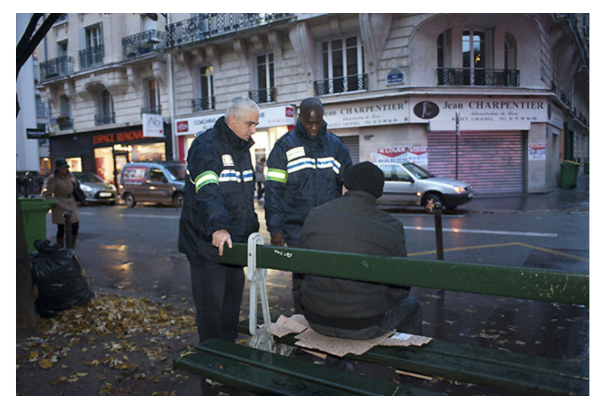
Homelessness is a critical issue in Paris and Parisians expressed their solidarity with homeless, refugees and migrants: the program Home for the homeless was the most voted PB project in 2016.

significant resources. Among the eight projects for Paris as a whole, the following can be highlighted as particularly innovative: