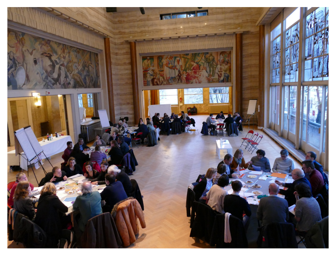
Workshop for co-construction of projects, gathering different individuals and associations who proposed similar projects or projects that could develop in synergy.